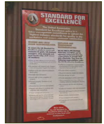
View of United Association Standard for Excellence policy which states that the labor-management commitment is to uphold the highest industry standards for quality in the workplace and ensure customer satisfaction.